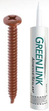
All-Purpose Fastener and Green Link Structural Adhesive/Sealant

The KnuckleHead System is engineered to safely support pipes, heavy equipment, duct work, solar panels and other rooftop accessories. KnuckleHeads are rated to hold up to 600 lbs. each or 16 psi distributed across the base (38.5 in 2 area). Insulation is the weakest component in a roof system subject to compressive loads. Type II Class 2 Iso-Broad is widely used, having a compressive strength of 20 psi ( TABLE 1 ). Compressive loading of 600 lbs. will not damage Iso Board or other recovery board underlayment. TABLE 3 provides the suggested maximum allowable support load when installing KnuckleHeads.